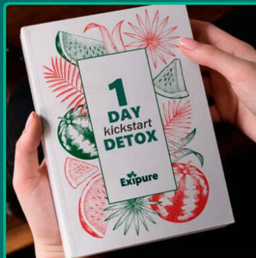
BONUS #1 1-Day Kickstart Detox

Order 6 Bottles or 3 Bottles and Get 2 FREE Bonuses!